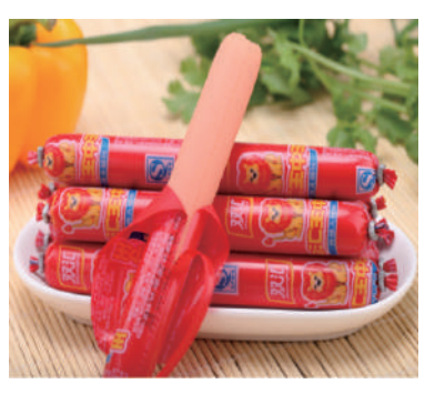
Sausage shrink wrap